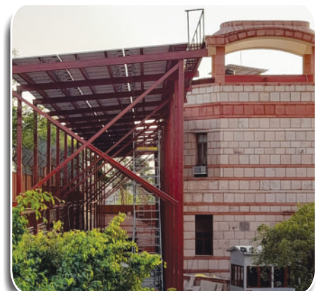
100 kWp Grid-Connected SPV power plant on elevated structure at ISKCON, New Delhi

REIL has successfully installed 100 kWp Grid Connected SPV Power Plant at ISKCON, New Delhi and 245 kWp Grid Connected SPV Power Plant at MECL, Nagpur.