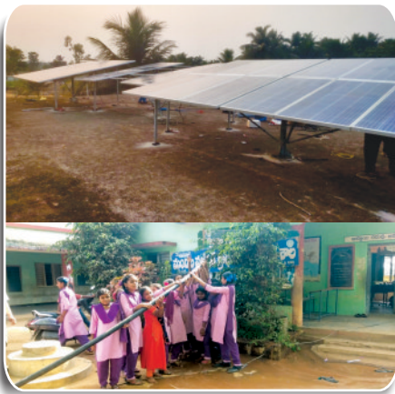
5HP SPV Water Pumping System installed at Govt. school, at West Godavari, Andhra Pradesh

Under CSR initiative of MECL Nagpur, REIL has successfully installed & commissioned 08 Nos. of 5 HP SPV Water Pumping Systems and 02 Nos. of 10 HP SPV Water Pumping Systems across PAN India.