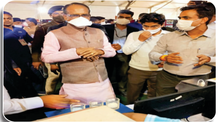
Hon'ble Chief Minister of MP while visiting the stall