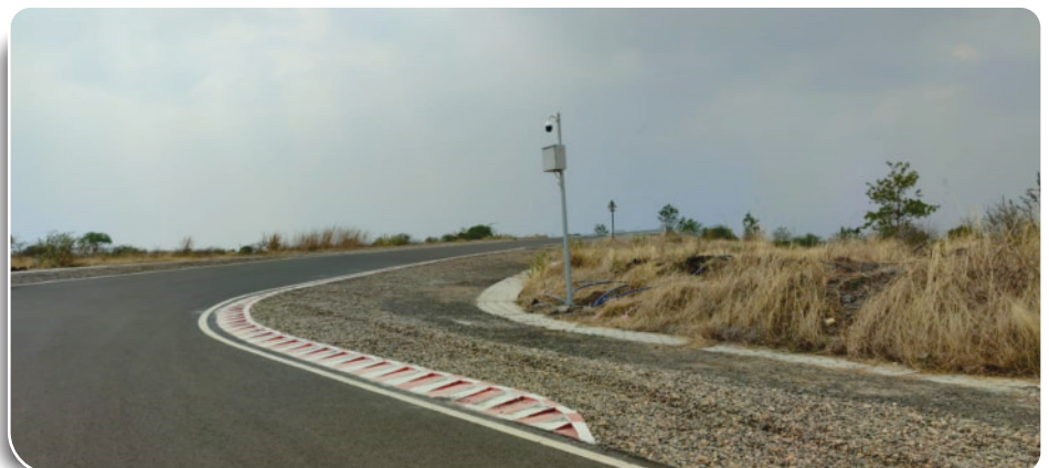
Cameras installed alongside the track at NATRAX Indore