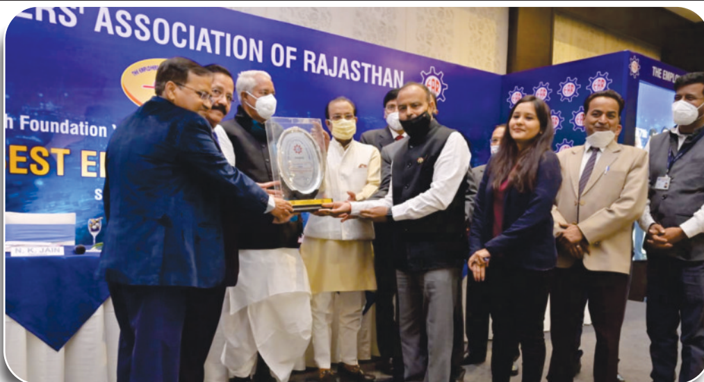
Best Employer Award to MD REIL and Team REIL by Employers Association of Rajasthan