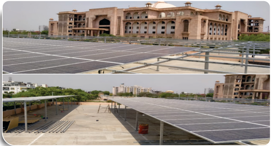
560 kWp Grid Connected Solar Power Plants (Car Port ) under Installation at Rajasthan Vidhansabha , Jaipur

In this quarter, REIL has executed several projects under various schemes like Roof Top Schemes, KUSUM Scheme, Smart City Mission, Vidhan Sabha Project and CSR Projects.