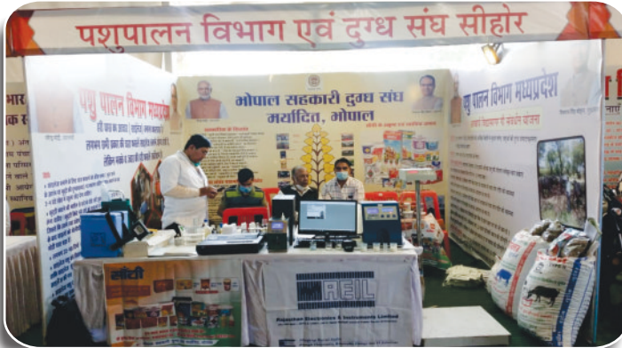
REIL product range during Rozgaar Mela at Sehore, Bhopal