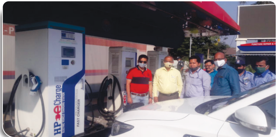
Electrical Vehicle Charging Station setup at a Highway : 122 kw and 2 nos. of DC001 at HP Auto Care Centre, Sajaon, Mumbai-Pune expressway